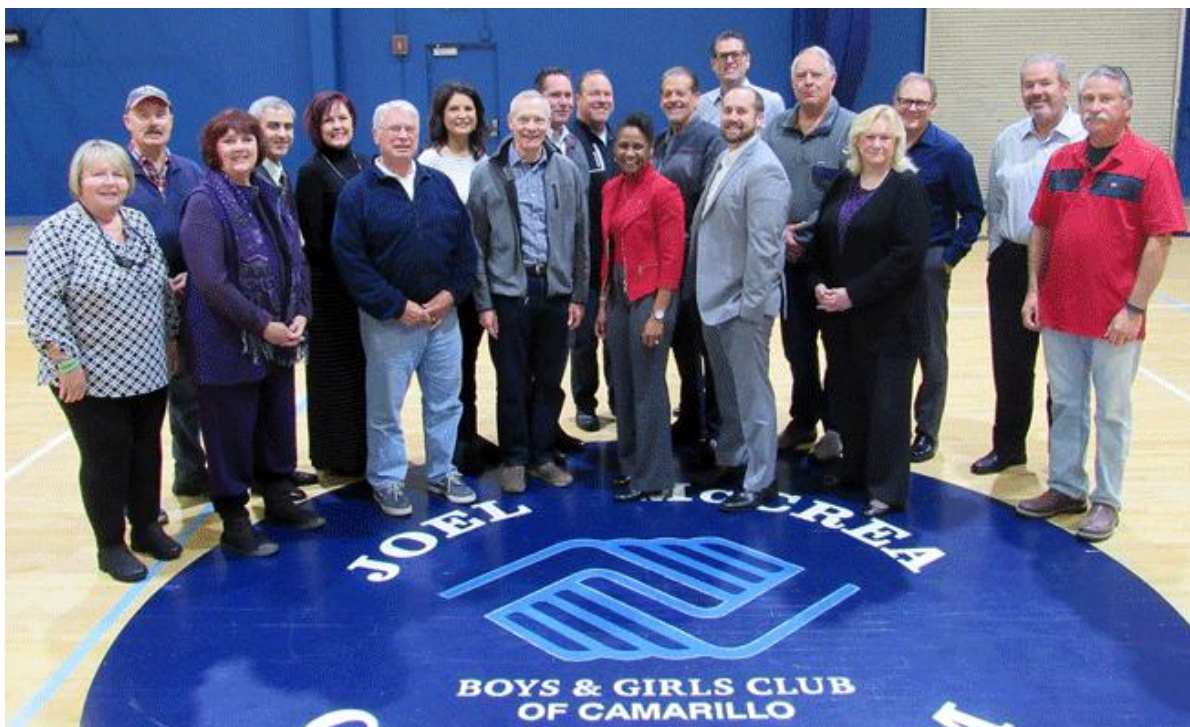
Board of Boys and Girls of Camarillo in the Joel McCrea gymnasium.

YMCA in Thousand Oaks. Another 75 acres became the Joel McCrea Wildlife Preserve along the Norwegian Grade.