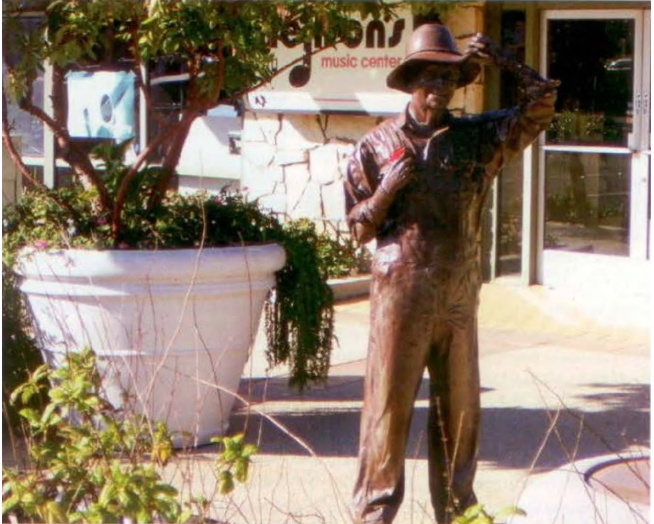
“Howdy!” The Walter Brennan statue on Ventura Boulevard