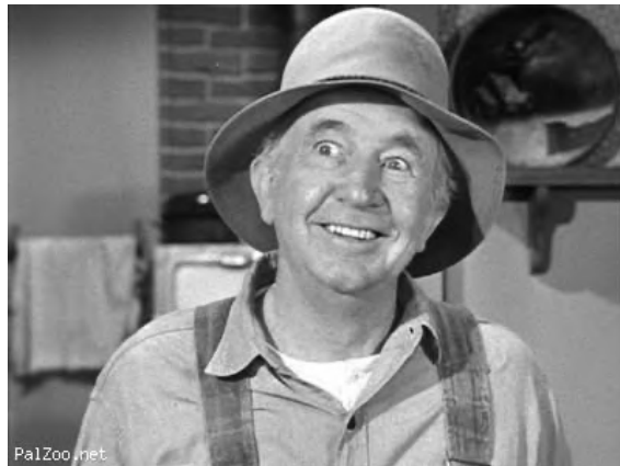
Walter Brennan as Amos McCoy from “The Real McCoys”