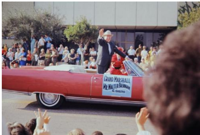
Walter Brennan in Camarillo Christmas parade on Arneill Road (date unknown)