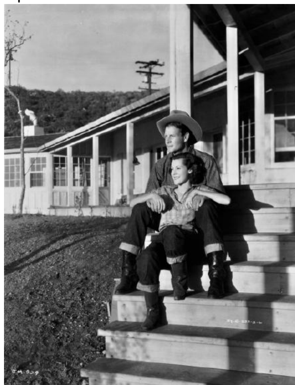
Joel and Frances Dee McCrea resting on their front porch