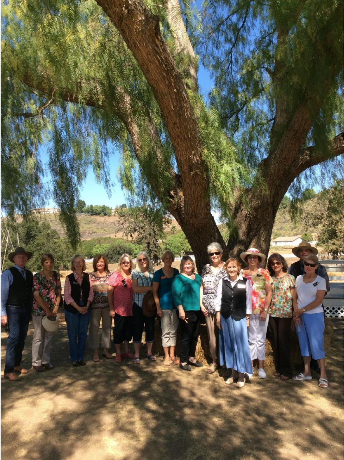
The Camarillo Ranch docents visited the McCrea Ranch