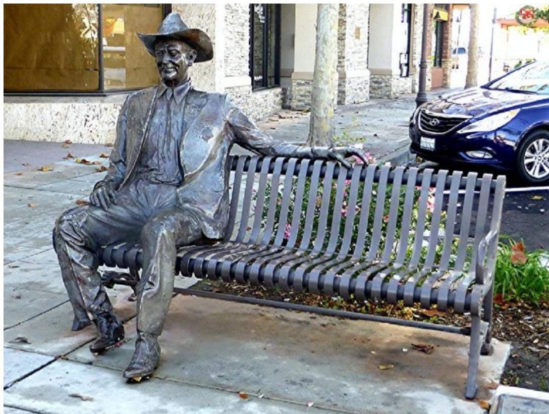
“Come and sit a spell.” The Joel McCrea statue on Ventura Boulevard