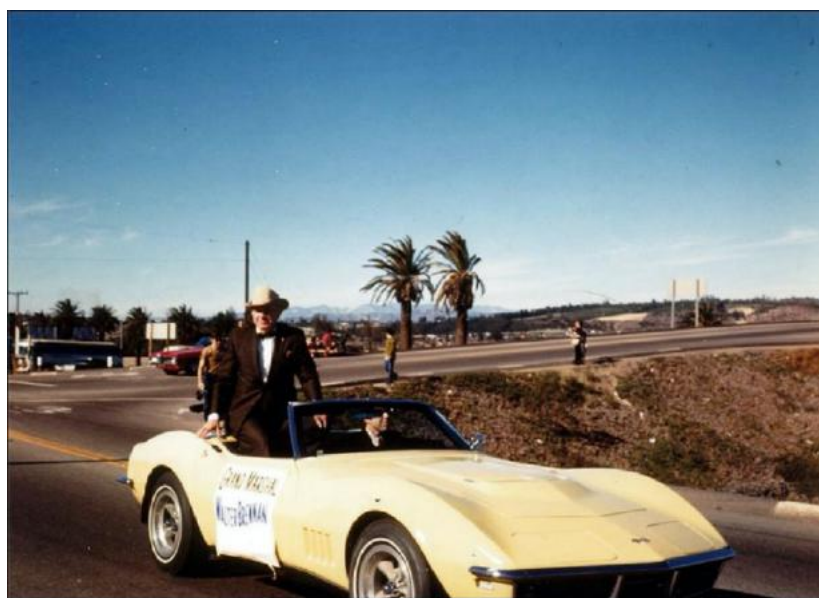
Walter Brennan at Carmen Drive and Ventura Blvd.