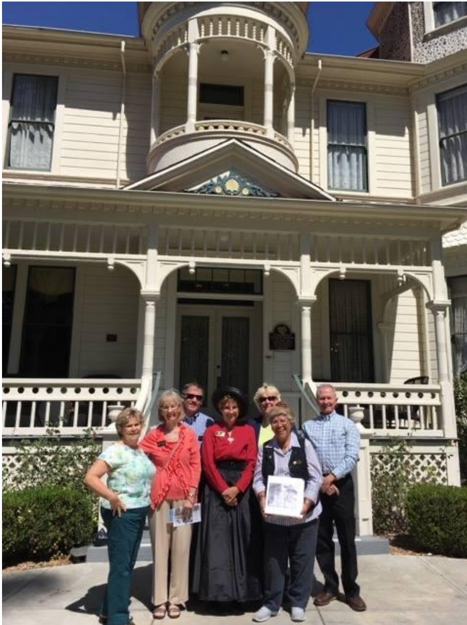
McCrean Ranch docents visited the Camarillo Ranch.